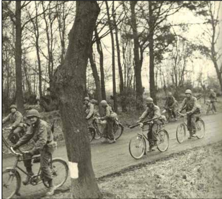
While the 31st ICHC was not focused on bicycles at war, the Conference was held in the Indiana War Memorial built to commemorate the brave acts of soldiers from Indiana serving to protect their family and friends at home. This photo portrays an instance in the 2nd World War in which bicycles were used to carry out this mission: The photo shows troops of the US Army's 84th Infantry Division using locally appropriated bicycles to make a move near the front in Rockelrath, Germany, on February 28, 1945.