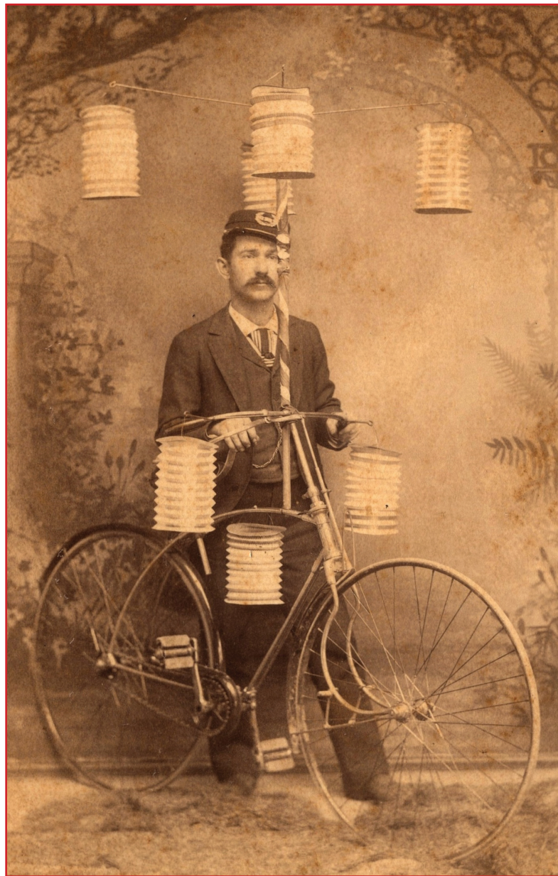
Hard tired Eclipse bicycle, circa 1891. Photo shot in Gainesville, Texas. From the collection of Lorne Shields, Toronto - Canada.