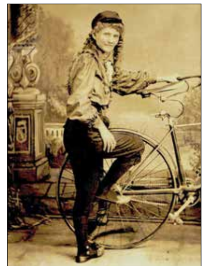
(right) I AM NOT A BLOOMER GIRL Studio image of a lady with her "hard tired safety". Note the mounting stance of her foot's placement at the back of the rear triangle. She is not wearing "bloomers", but rather she is wearing tapered slacks (called plus fours) that were commonly identified as male attire. Yet she is very feminine (note her long flowing hair and her lovely blouse). An interesting fashion statement with an uncommon view of fashion at the time. Size is 2-1/2" x 5-1/4". No identification of either the photographer or the country of origin. Tintype (aka Ferrotype). Circa 1889. Likely USA.