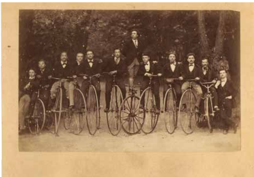
(left) TRANSITIONALLY YOURS Illustrated is a group of riders from the Velocipede Club of Lyon which was one of the earliest Velocipede Clubs in the world. There are ten members with cycles and two without. Bikes include a traditional "velocipede"; several "transitional wood, or wire, spoked 'open head' high wheel bicycles. Note the formal attire and the one rider balancing on the saddle. Selected because of the scene, clothing, outside location, and exceptional variety of early bicycles. Size of mount is 12-1/4" x 9". Size of image is 7" x 5-1/2". Albumen photograph. Joguet pere & fils. Circa 1872. Lyon France.