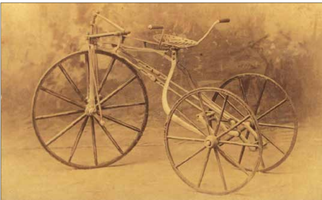
NOW LETS GO OVER THIS AGAIN ...AND AGAIN A front facing velocipede era tricycle with a revolving crank drive. Rider faces towards the two small front wheels while seated on a tractor style saddle. The rear driving wheel was actuated by pedals attached to the axle between the front two wheels by a complicated mechanism, and steering was accomplished by the rear wheel that was turned by handlebars that were attached under the seat and linked to the top of the rear wheel’s fork. An example of a highly odd and unusual tricycle. 4-1/8” x 2-1/2” albumen photograph by W. A. Robinson. Circa 1878. Chicago, Illinois, USA.