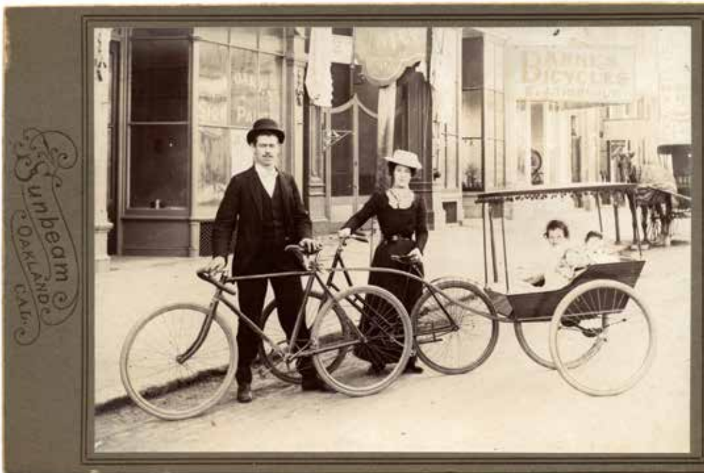
WHAT WAS AROUND COMES BACK AROUND Man and lady each with their 1890s safety bicycles getting ready to go out for a spin. The man’s bike has a canopy covered children’s buggy attached. Note the spring suspension. There are two children in the buggy. The background shows a shop selling Barnes Bicycles with the proprietor’s name: E. J. Thibault. This buggy for children predated the very popular model developed in the 1970s. Cabinet Card is 6-1/2” x 4-1/4”. Photographer is Sunbeam. Circa 1900. Oakland, Cal., USA