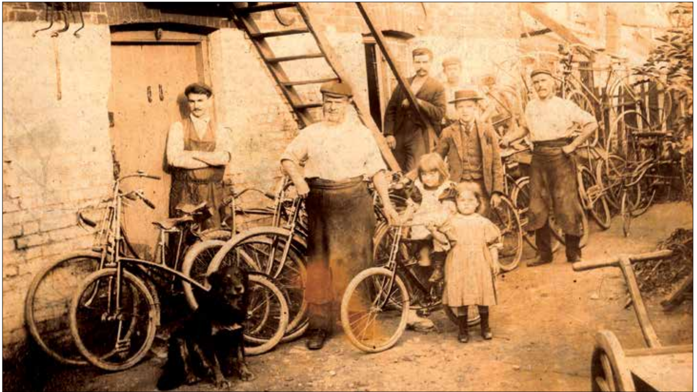
THE END OF AN ERA Sirett's Cycle Works of Bicester in Oxfordshire: a look at an example of a 'modern' Crypto Bantam #2. Can you imagine being the scrap dealer who was called to pick up the obsolete 'junk' stacked at the back (a mid-1880s tricycle & a hard tired safety). This photo affords the opportunity to view the clothing that was worn

by people who worked at the shop. Note the aprons on some of the men. All the men (not the youth) wore similarly matching caps. The photograph captures a microcosm of time in the post hard tired safety era. 8-1/4" x 6" gelatin print. No photographer identification. Circa 1897. Bicester, England