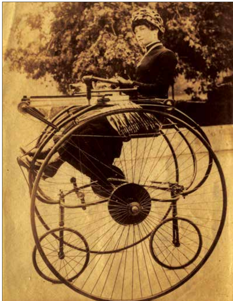
(below) ROW, ROW, ROW YOUR TRIKE, GENTLY DOWN THE PATH. The lady is relaxed while sitting on her quadricycle in an outside environment. She is a Victorian fashion statement with her matching ruffled cap and dress, high button shoes, and gloves. A highly technical and innovative cycle is illustrated. This mechanical wonder is propelled by a combined rowing and levered pedal principal. A highly unusual vehicle that well suits the definition of "odd". 3-3/4" x 5-1/2" albumen photo. Unmounted. No photographer's identification. Circa 1883. No location identified but acquired in England.