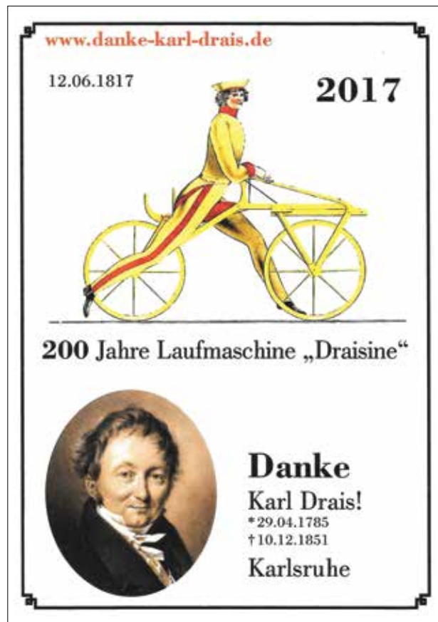
A postcard for the 200th Anniversary of the Invention of the Draisine by Karl Von Drais. Karl Von Drais on his Laufmaschine (top) and his portrait (bottom).