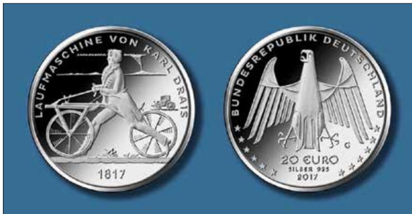
Momentos issued to Commemorate the 200th Anniversary of the invention of the draisine by Karl Von Drais: A First Day Postal Cover issued in Berlin, Germany, on July 13, 2017, to Commemorate the 200th Anniversary of the invention of the Draisine and a 20 Euro silver coin (front and back) issued by Germany in July 2017.