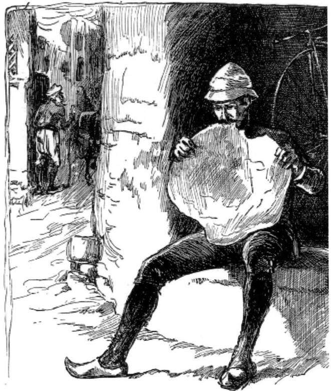
Fig. 15.2. Stevens discovers ekmek in a Turkish village near Angora.