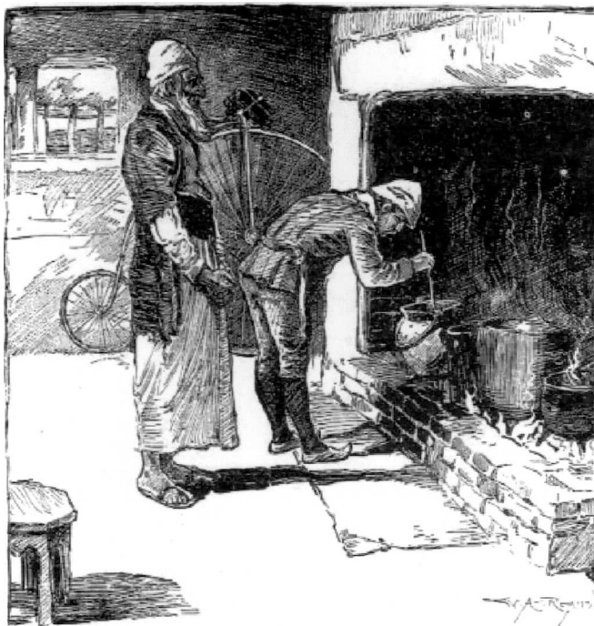
Fig. 15.1. Stevens inspects pots of food being cooked at a khan(inn) in Turkey.

Food in wayside inns in the Hungarian countryside was usually limited and unappetizing. Thus, on the way to Sarengrad (June 13), Stevens stopped at a roadside tavern (a mehana) for some refreshments. The only food available was a thick narrow slice of raw fat bacon that was white with salt, coarse black bread, and red wine. Stevens passed